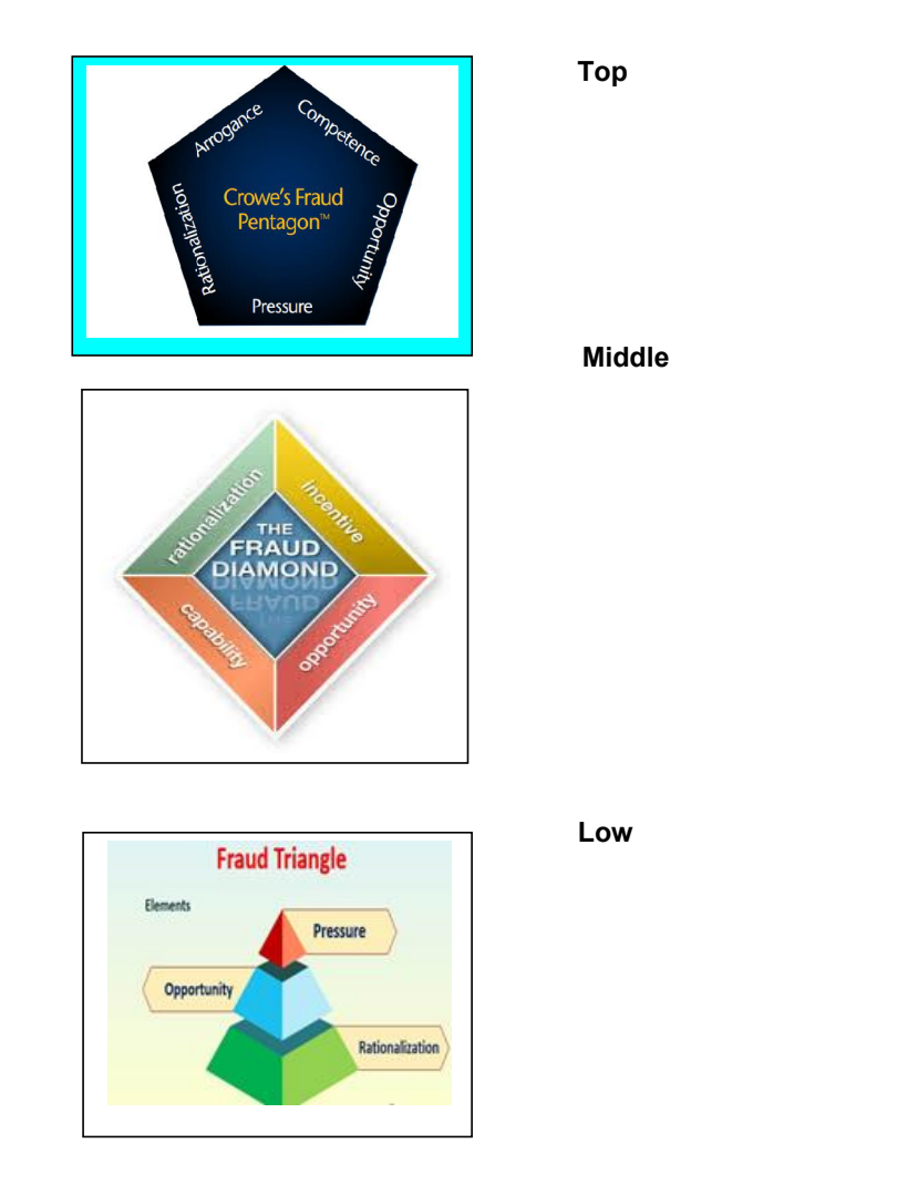
Figure 5. Fraud theoretical models related to the management flowchart.

All of them have some traits in common initiative/pressure, rationalization and opportunity. So this way, one can refer that the triangle model is embedded in all the other models because they are primary factors that can explain fraud existence.