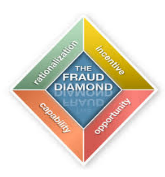
Figure 2. The diamond model. Source: https://chapters.theiia.org/miami/ChapterDocuments/Raise%20the%20 Red%20Flag-%20Lynn%20Fountain.pdf.

Yet, we must be very careful when making generalizations because the frauds depend on many variables. For instance if we look at literature, authors like Zaini, Carolina and Setiawan (2015) found different results but as to the academic environment: they showed that pressure, on a student's perspective, has positive and significant effect on academic fraud behavior enabling the triangle model.